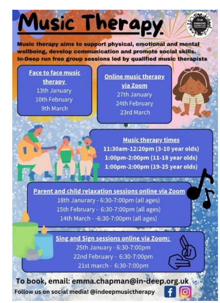
Click here for more information