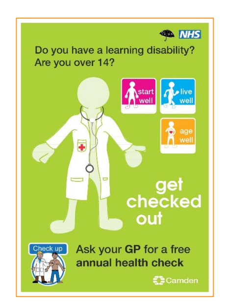
Click here for more information