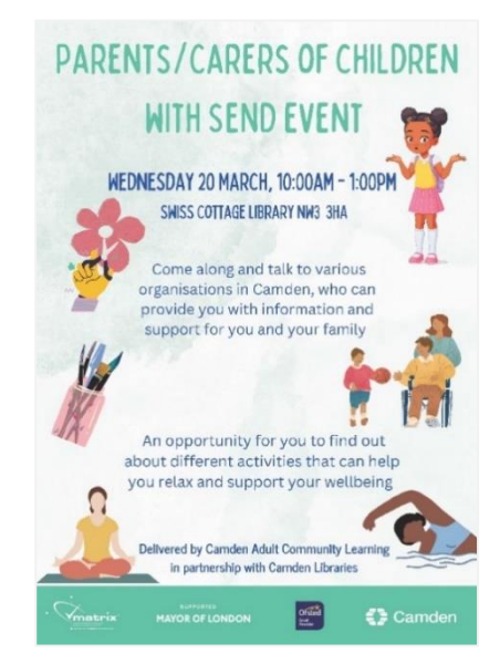
Click here for more information